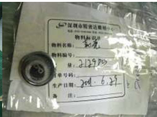
Counterfeit watch back cases found in Stock