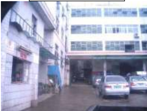
Exterior of the target