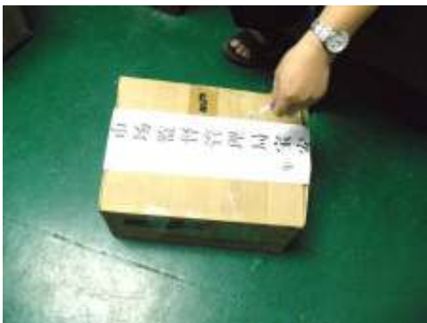
Seizure being moved away